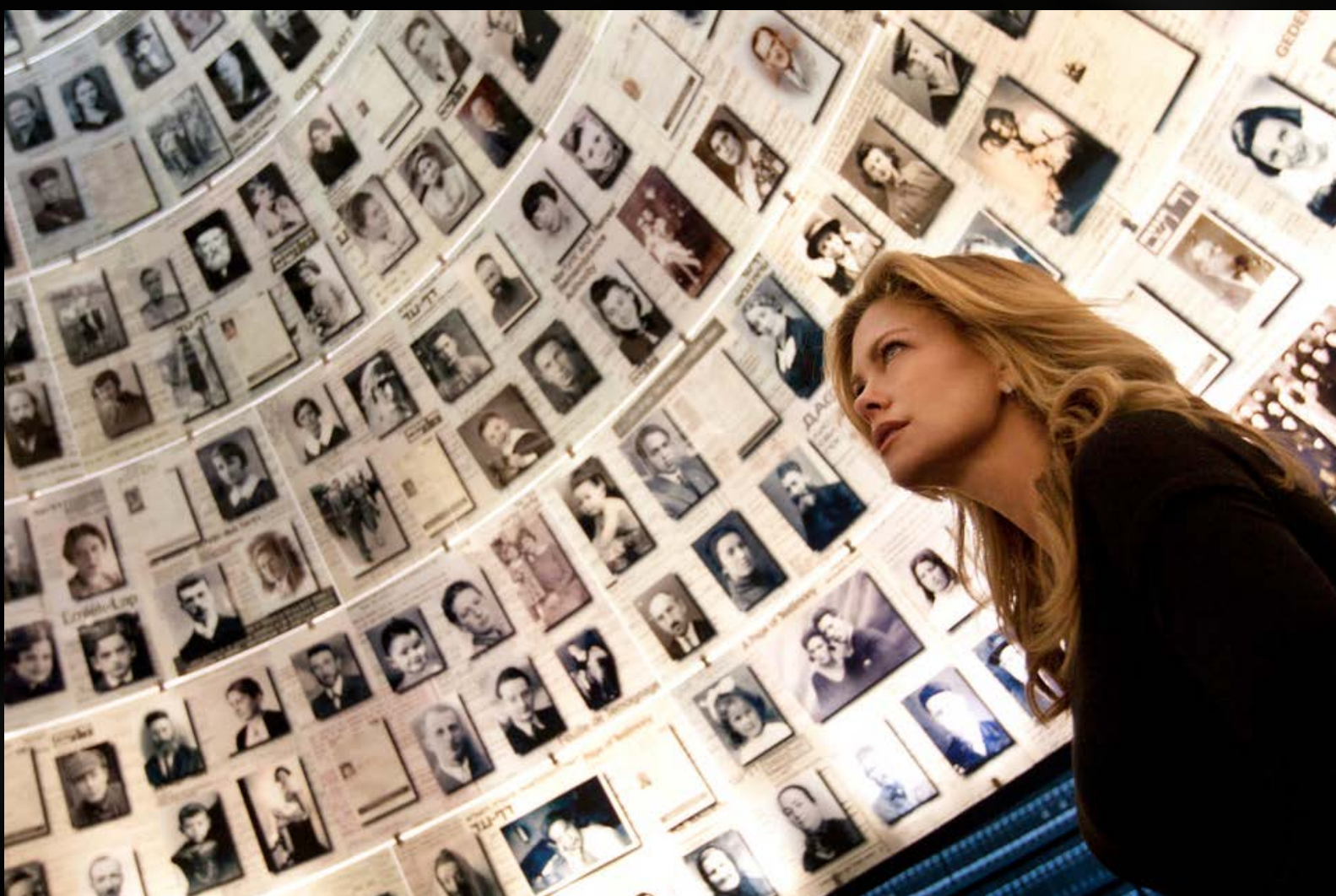
Kathy Ireland at Yad Vashem, Israel