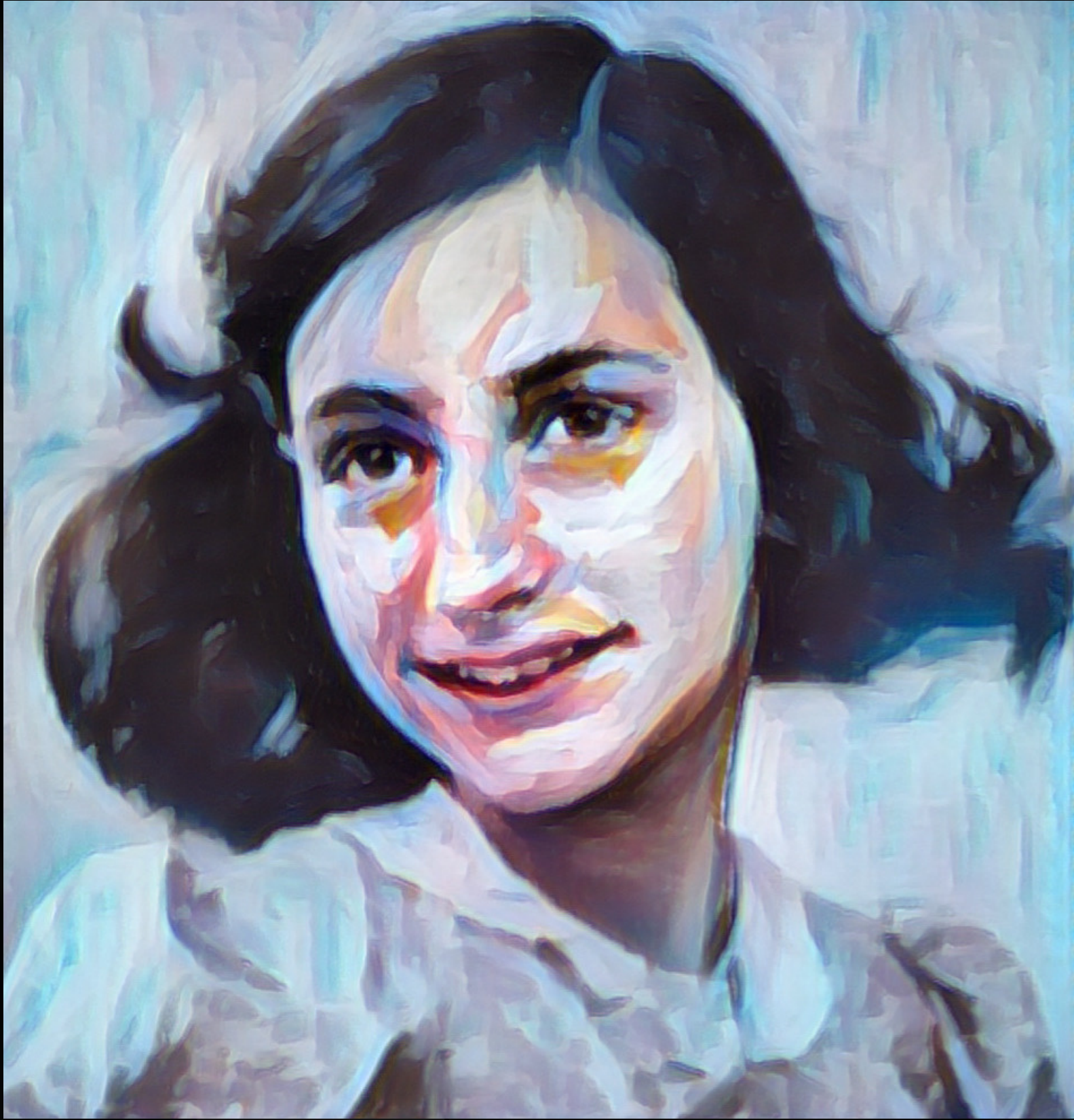
The legacy of Anne Frank, Netherlands

Over 6,000,000 people Murdered by Hitler & Nazi regime because of their religious faith.