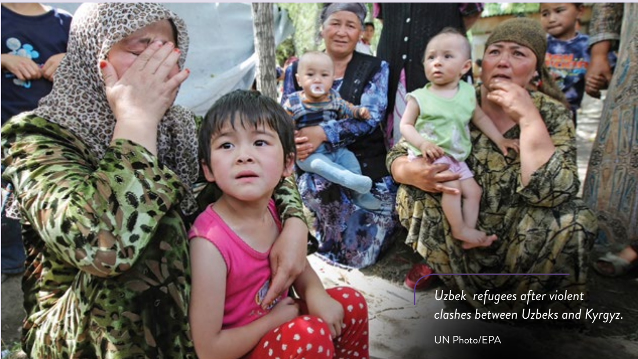
Uzbek refugees after violent clashes between Uzbeks and Kyrgyz.